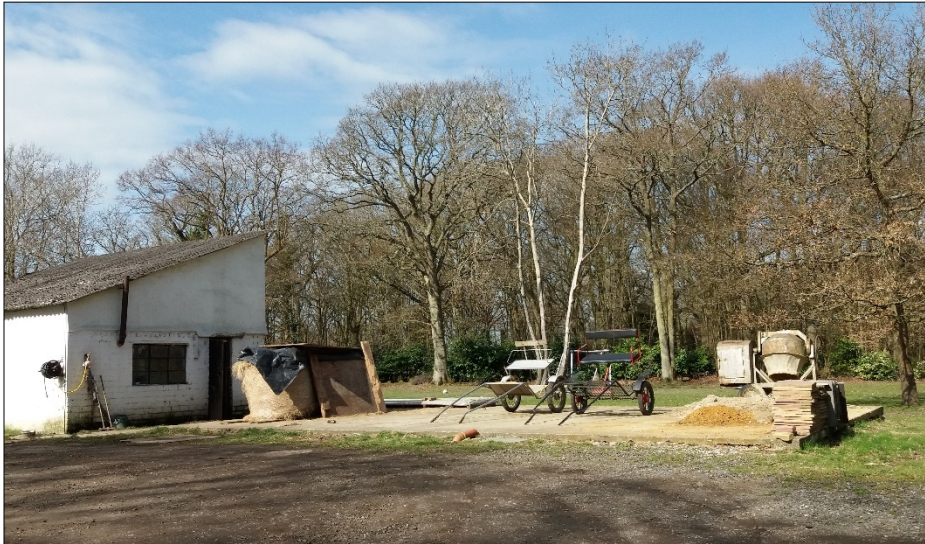
Figure 3: Photo of existing concrete slab

“3) Remove from the Land all concrete bases and remove from the Land all building materials and rubble arising from compliance with this requirement.”